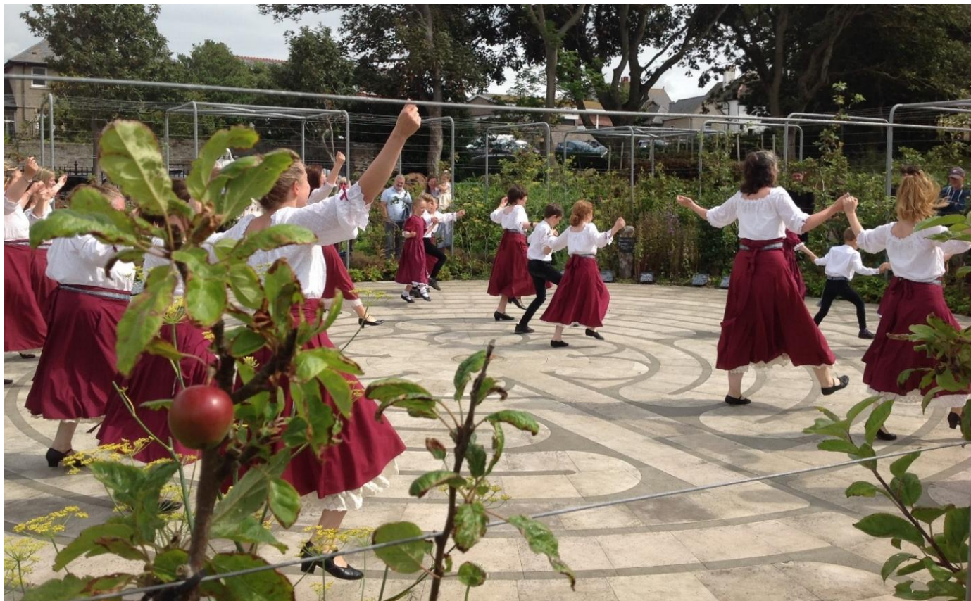
Above: Dancing on the Labyrinth at 'Our Island, Our World Event'