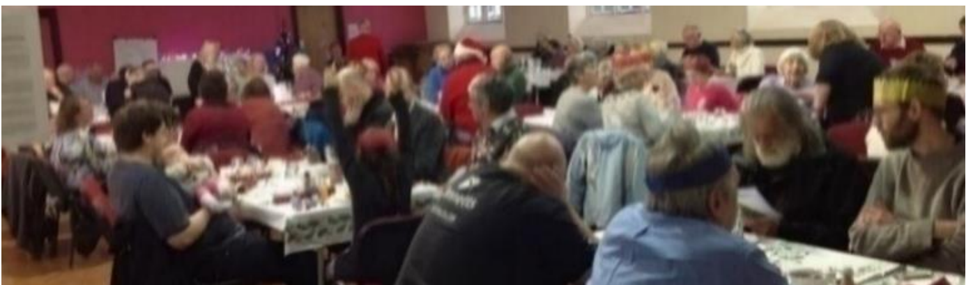
Above: Big Table Café in the Corrin Hall