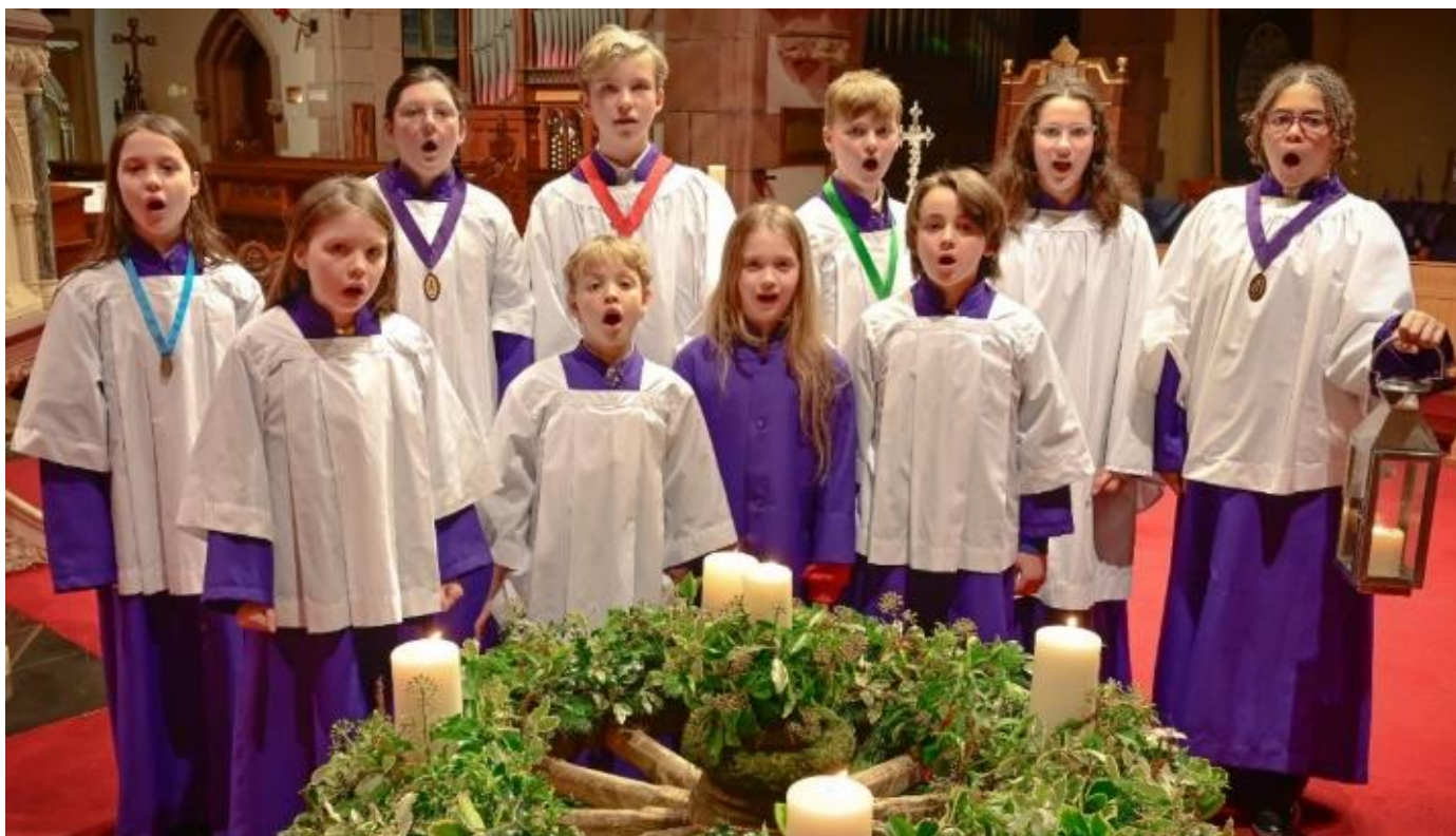
Above: Choristers singing round the Advent Wreath