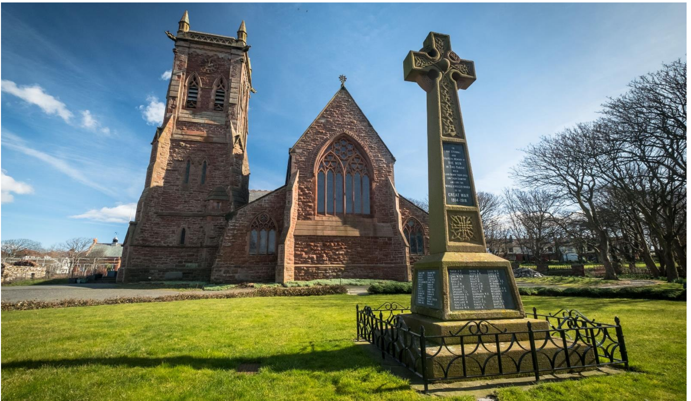
West Front: St. German's, Cathedral, Peel. Isle of Man

A Cathedral re-ordered for Mission in 21 st Century